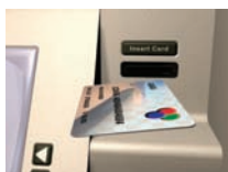
Insert your card

These are examples from the screen based animations which encourage high customer usage and provide easy guidance through the entire transaction