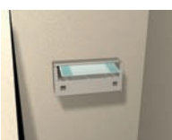
Insert your note