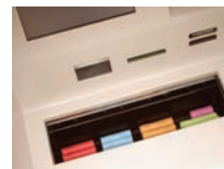
Coin rolls delivered