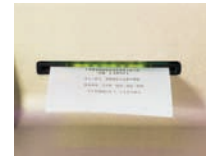
Your unique receipt